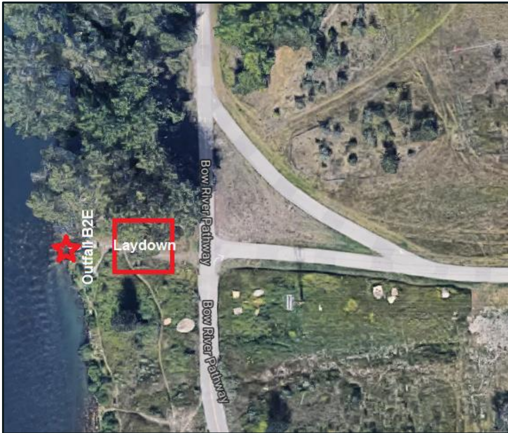
Figure 2: Outfall B2E Laydown adjacent Bow River Pathway