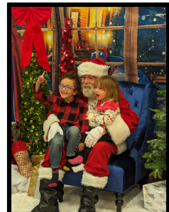
SANTA CLAUS IS COMING TO TOWNE