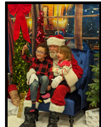
SANTA CLAUS IS COMING TO TOWNE